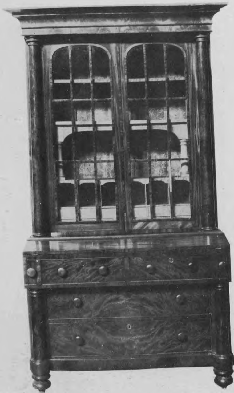
Secretary from the surrender room in the McLean house.