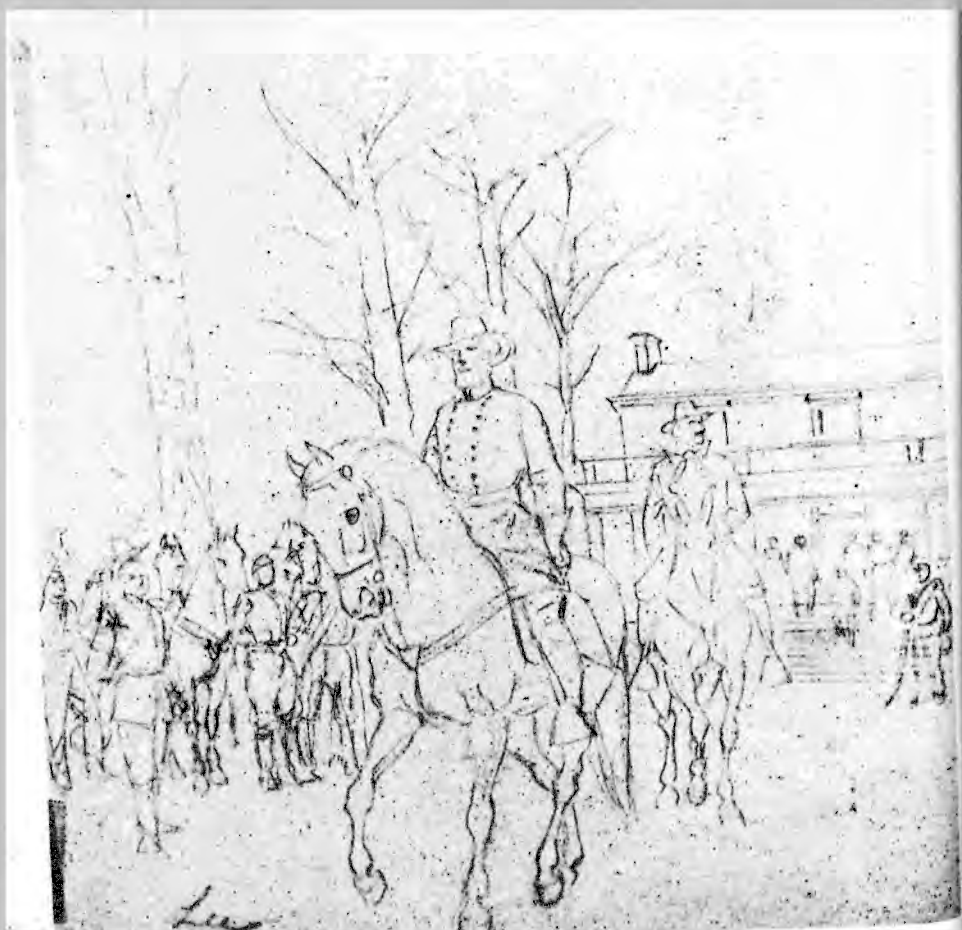
General Lee and his aide, Colonel Charles Marshall, ride away from the McLean house after the surrender.