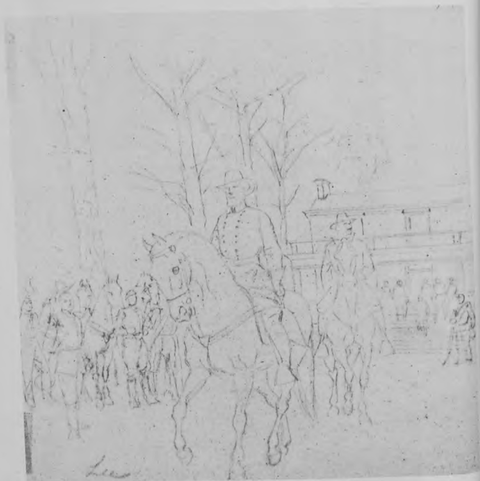
General Lee and his aide, Colonel Charles Marshall, ride away from the McLean house after the surrender.