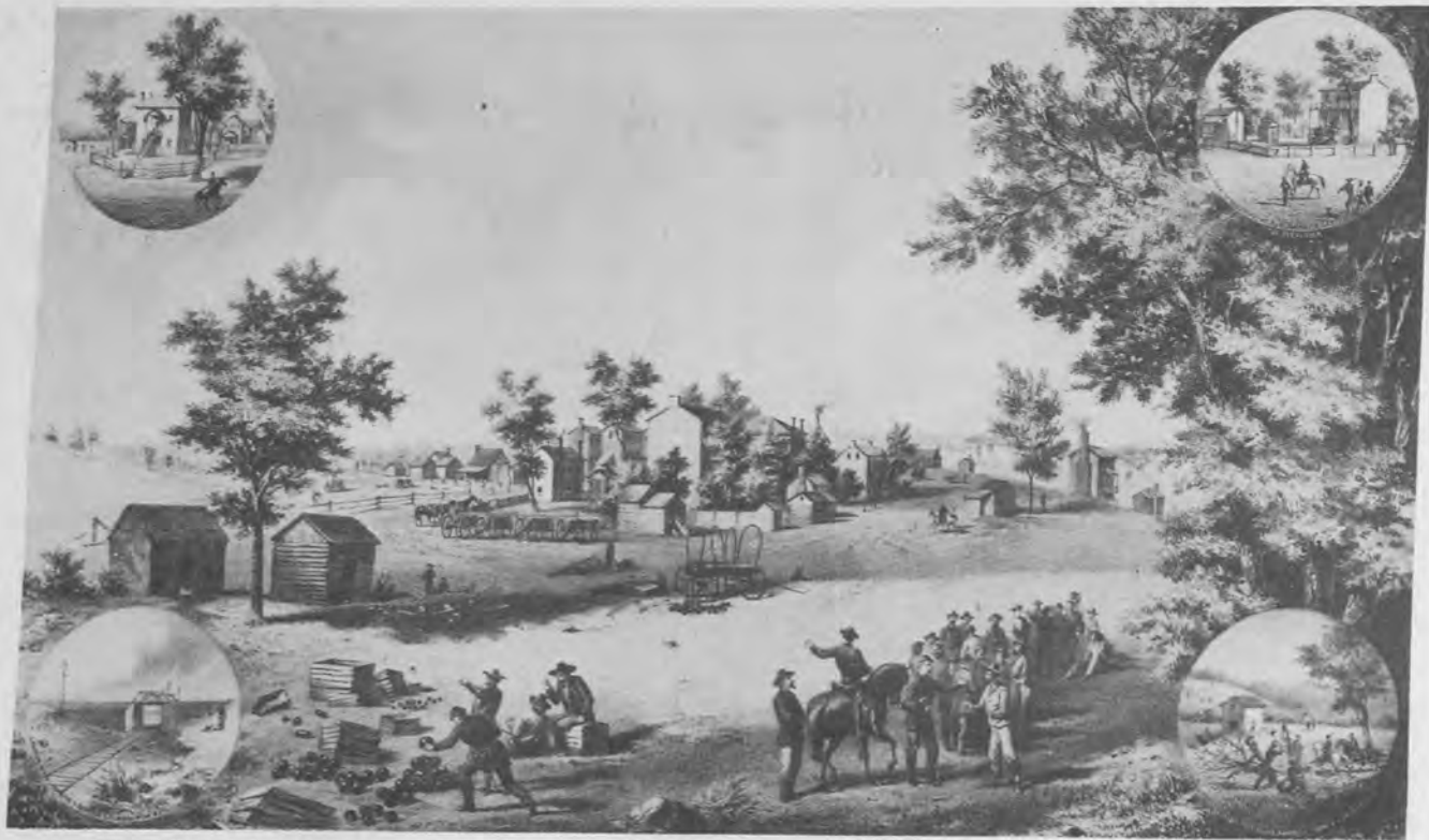
The village of Appomattox Court House as it looked in April 1865. From a contemporary lithograph.