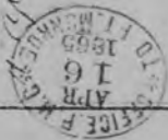
A printed and signed pass permitting a paroled soldier to return home.