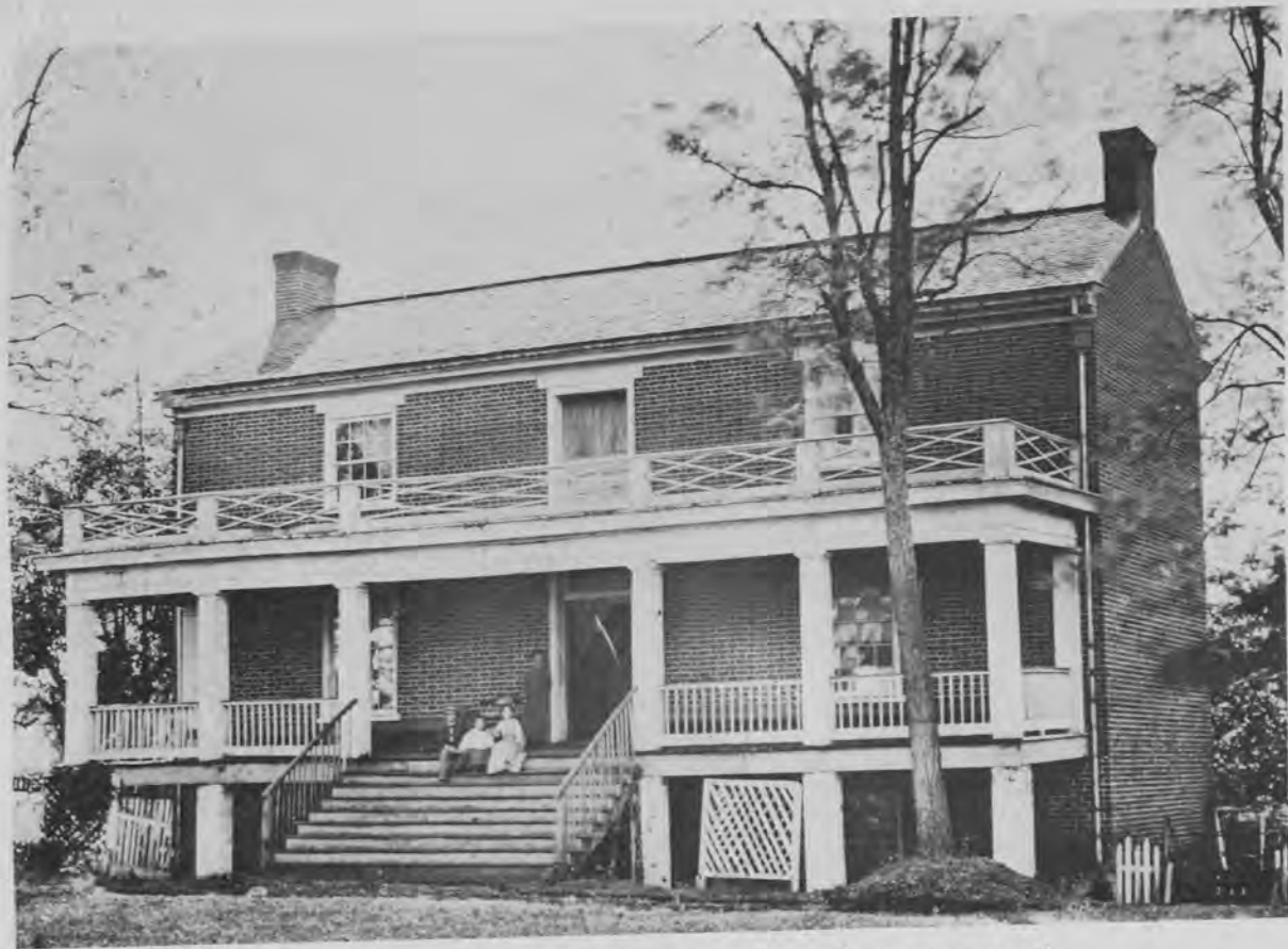
Wilmer McLean's house where the terms of surrender were arranged.