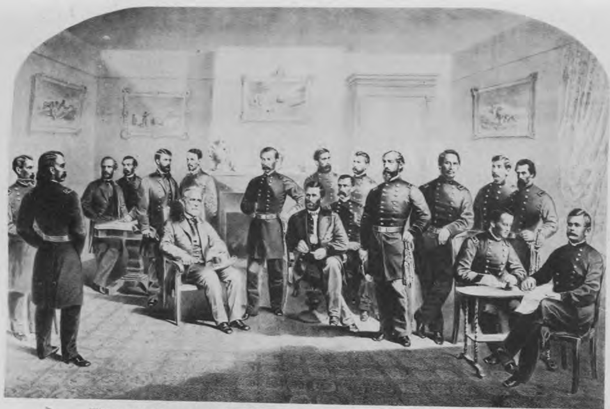
The surrender scene in the McLean house. From a contemporary lithograph.