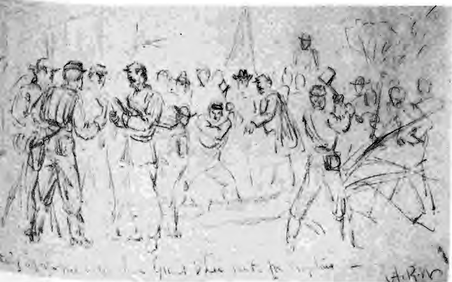
Union soldiers cut down the tree under which Grant and Lee met — according to the artist's caption. A drawing by A. R. Waud.