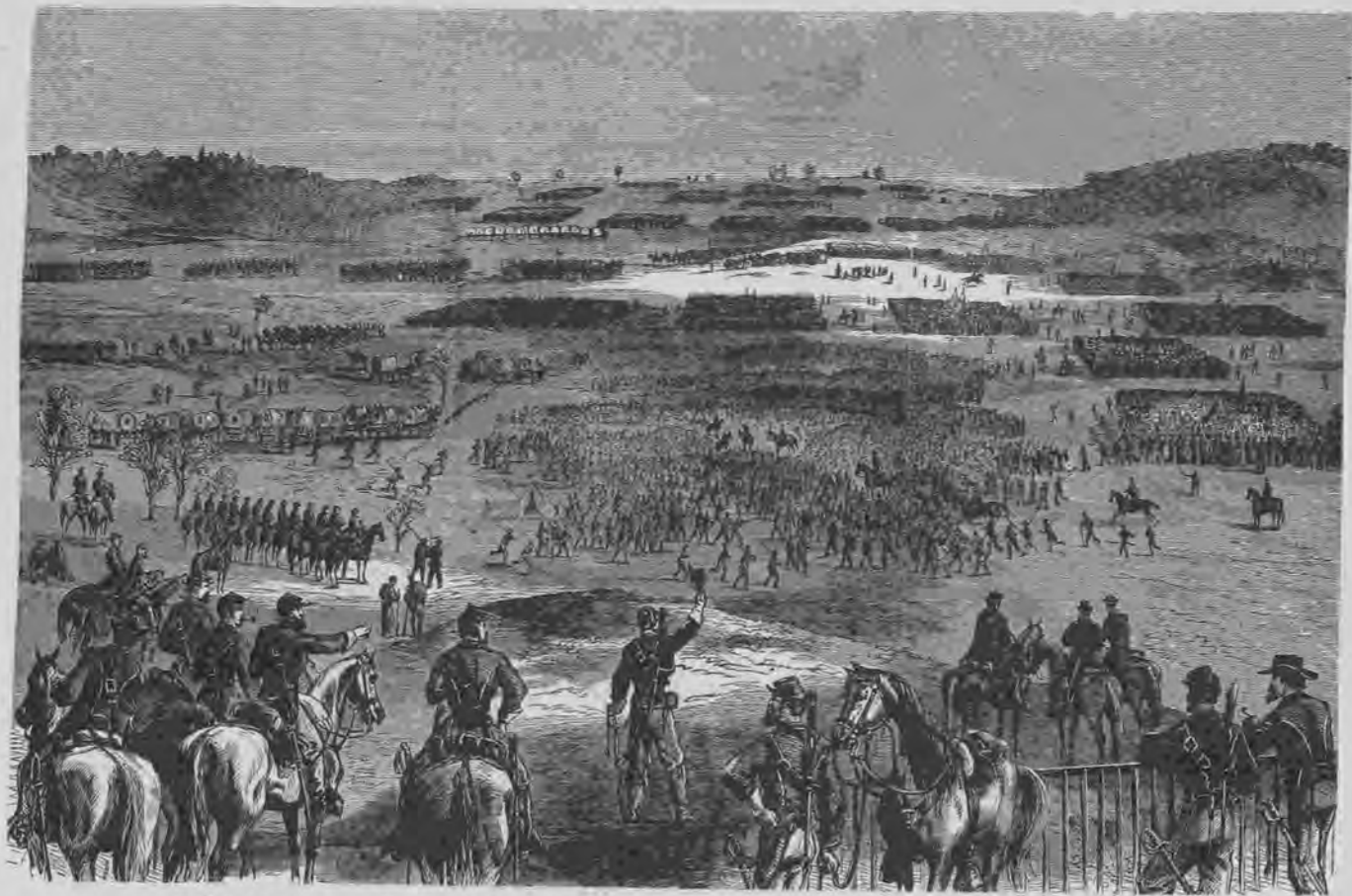
The position of the Confederate Army on the field when the surrender was announced.