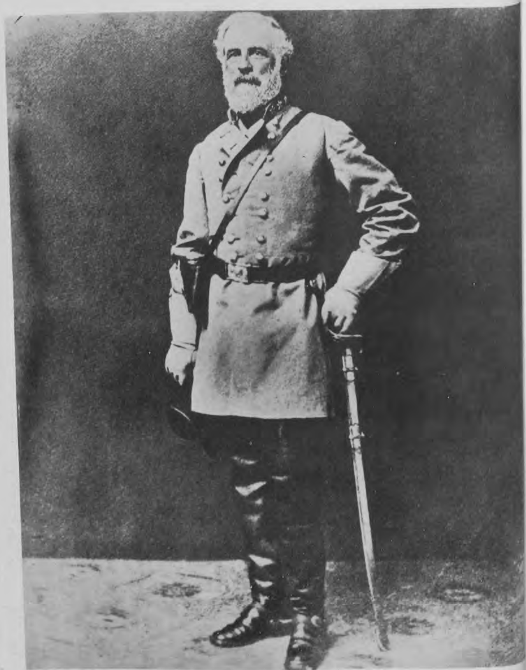
General Robert E. Lee in battle dress. Confederate Museum, Richmond