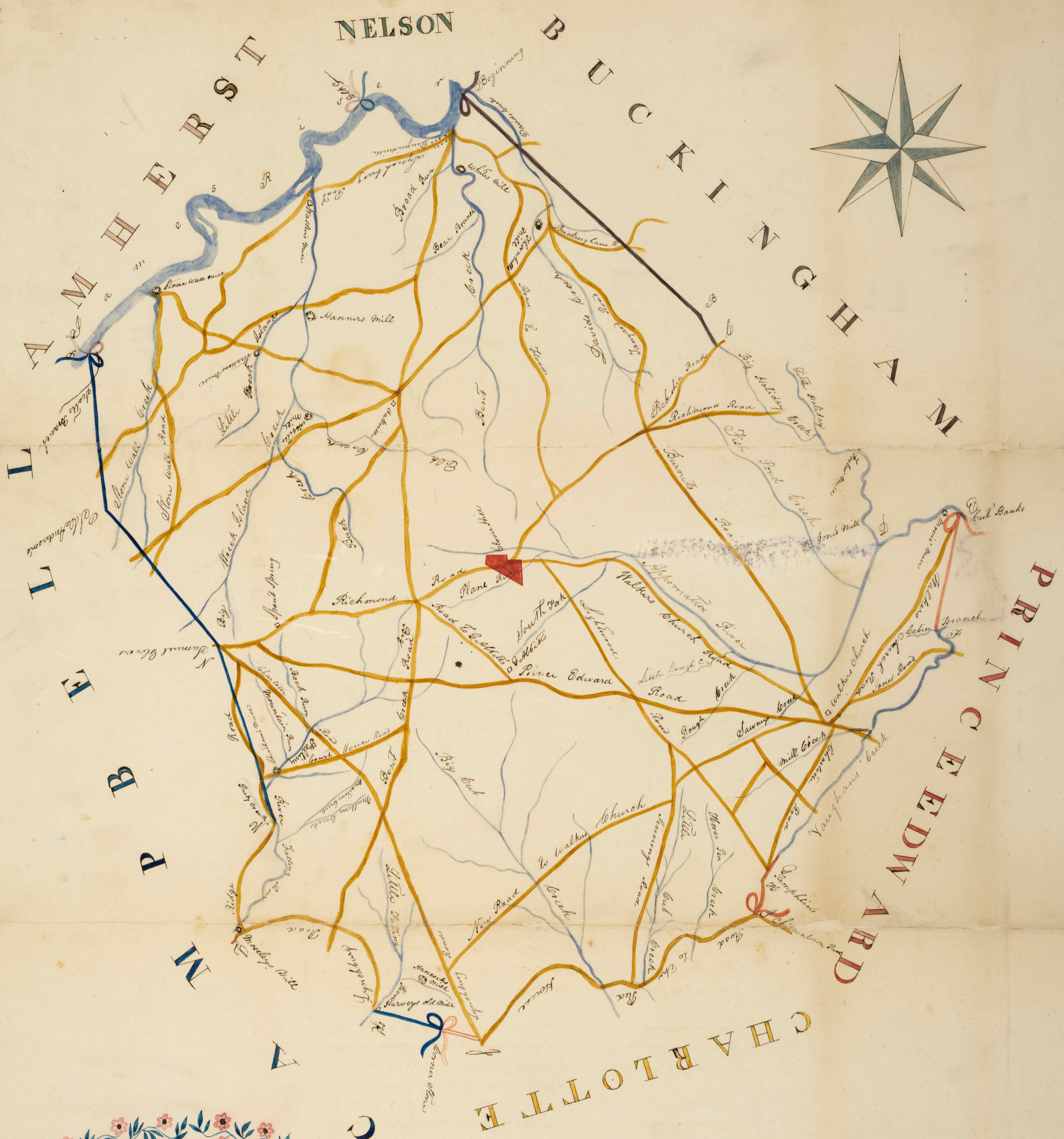
MAP OF APPOMATTOX