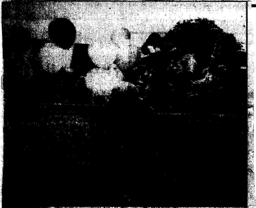
It was among the many entries into Saturday's parade Anniversary Celebration.