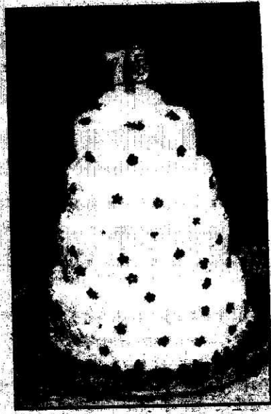
As part of the Town of Appomattox's 75 th Anniversary Celebration, a special three-layer cake was prepared and eaten on Sunday afternoon during a special dedication. A slew of other activities was a part of the weekend celebration in Appomattox.