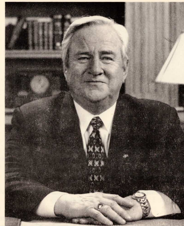
The Reverend Dr. Jerry Falwell