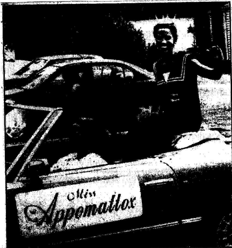
Miss Appomattox waves

to a large crowd of fans during the parade in the Old Virginia