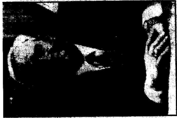
REV. JERRY FALWELL

offer a number of musical acts and other entertainment, food and craft booths, a reenactment of the 1925 application of the town charter, a birthday cake-cutting ceremony,