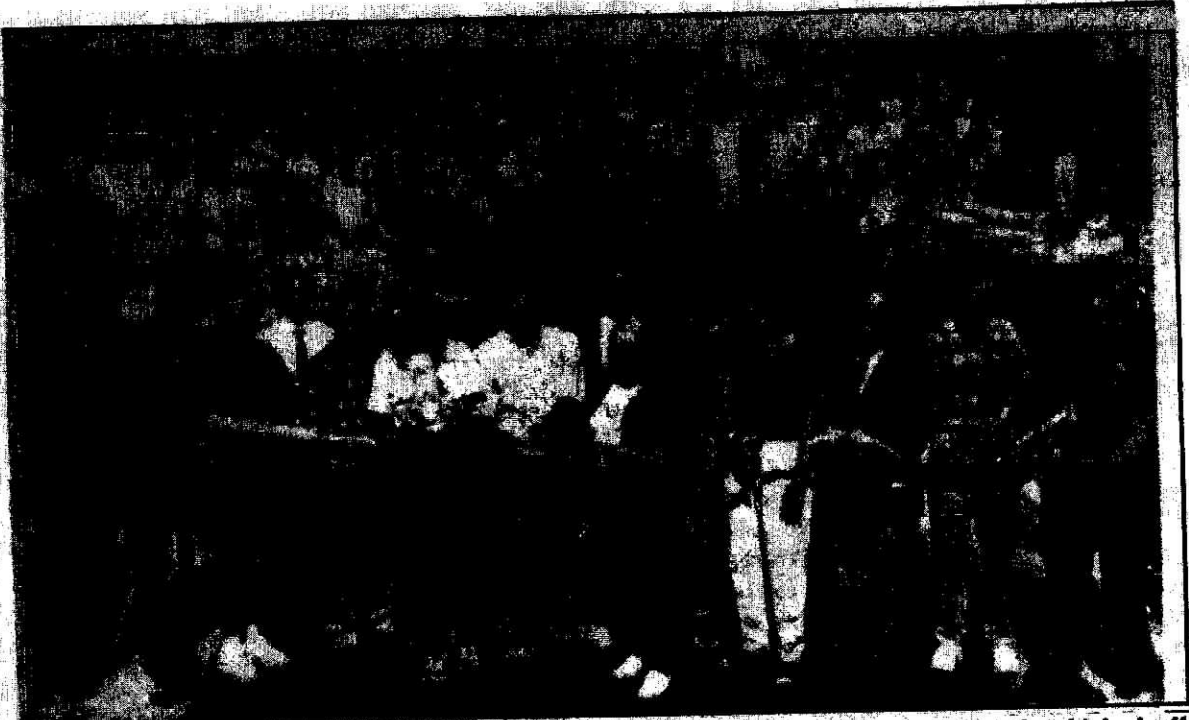
Downtown Appomattox business leaders prepare for the ribbon-cutting ceremony that kicked off Main Street Dedication and Celebration on Saturday.