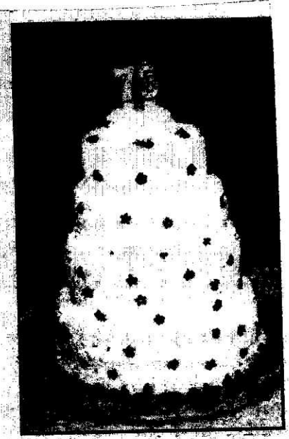
As part of the Town of Appomattox's 75 th Anniversary Celebration, a special three-layer cake was prepared and eaten on Sunday afternoon during a special dedication. A slew of other activities was a part of the weekend celebration in Appomattox.