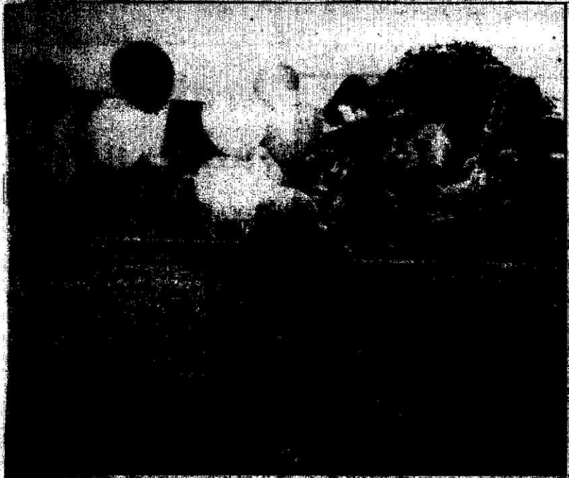
It was among the many entries into Saturday's parade Anniversary Celebration.