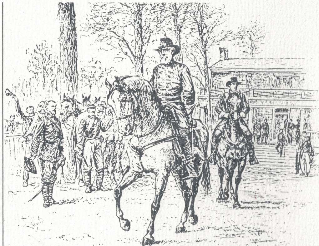
GENERAL LEE AND COLONEL MARSHALL LEAVING McLEAN'S HOUSE AFTER THE SURRENDER. FROM A SKETCH MADE AT THE TIME.