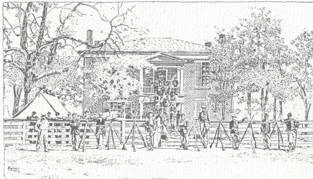
APPOMATTOX COURT HOUSE. FROM A WAR-TIME PHOTOGRAPH.

There are five colleges within commuting distance of Appomattox: Hampden-Sydney College and Longwood College in the Farmville area and Liberty University, Lynchburg College and Randolph Macon Women's College in Lynchburg.